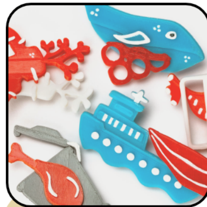
CLEAN & GREEN Dominika Špáníková (UTB ADE)